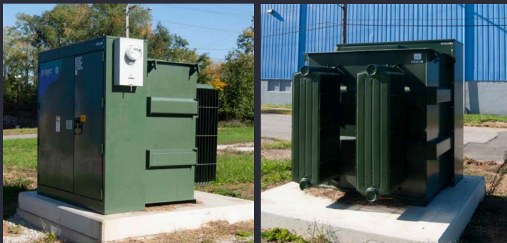
With facilities already in place at the site, CPP was able to develop a plan to improve power quality and handle the increased electric load.