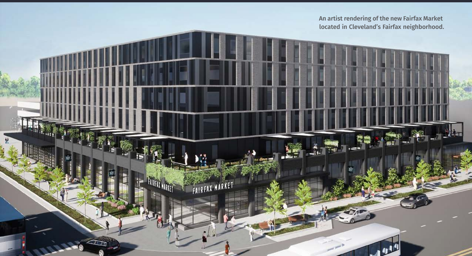
An artist rendering of the new Fairfax Market located in Cleveland's Fairfax neighborhood.

This development is another example of the importance of collaborating with local organizations to ensure the continual growth of Cleveland neighborhoods.